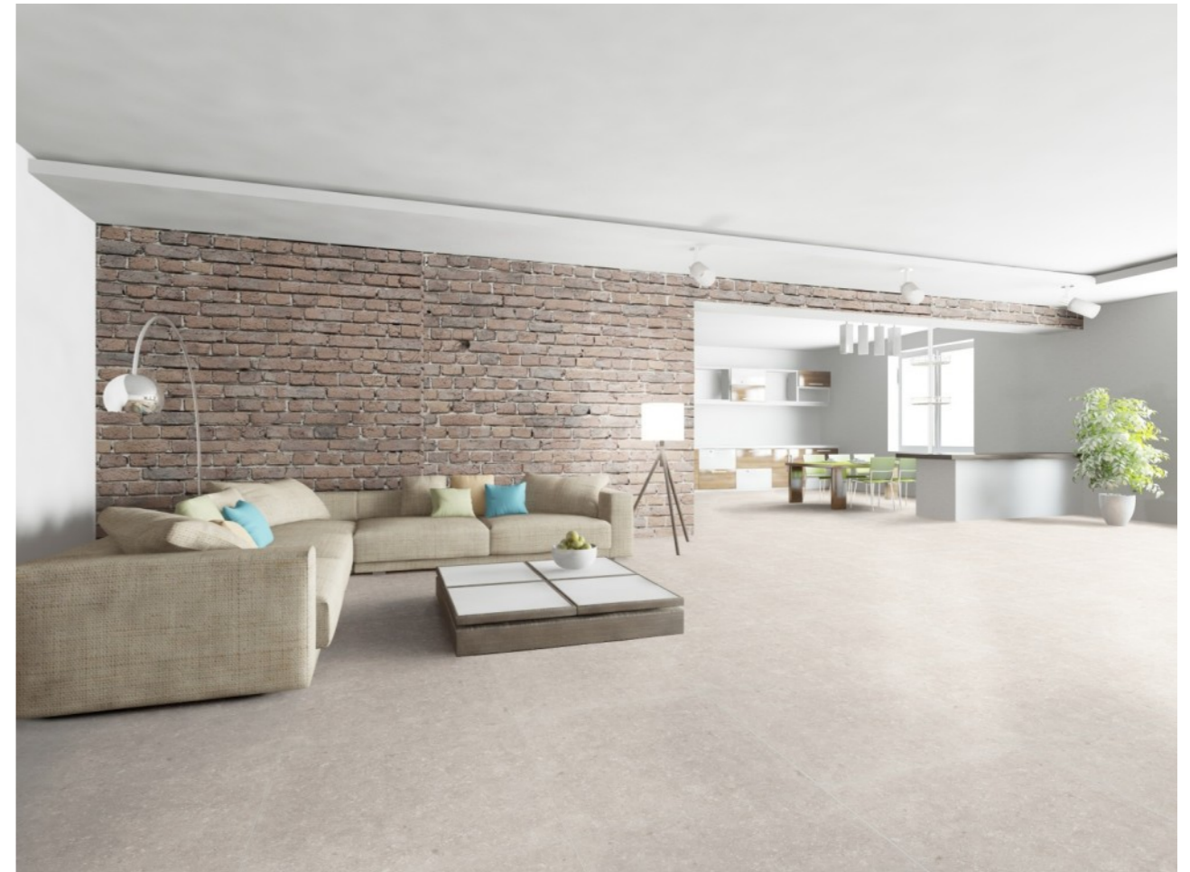
Italian ink-jet design Gres Porcelain Floor Tiles